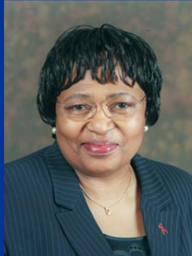
Minister of Health: Manto Tshabalala-Msimang