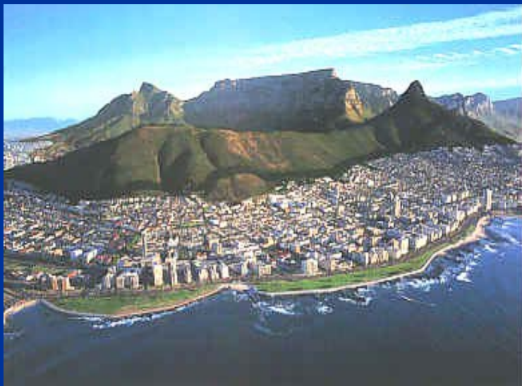
Cape Town – South Africa